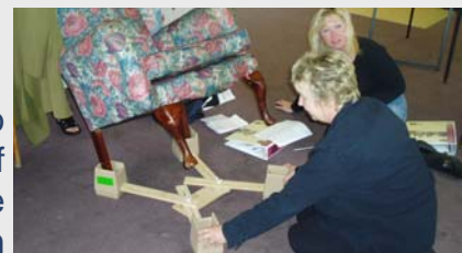
Candidates fitting chair raisers on the course

This unit provides learners with the skills and knowledge needed to consider the assessment and provision of targeted aids and equipment related to domestic routines and personal care. It considers how to promote independence within the home environment.