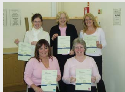
Disability Officers from Bury MBC with their BTEC Certificates

The award is continuously assessed and consists of 11 assignments, a witness testimony and the completion of a reflective diary. A variety of formats are used including; scenarios, multiple choice, written questions and answers, projects, simulations and hands-on work based assessments.